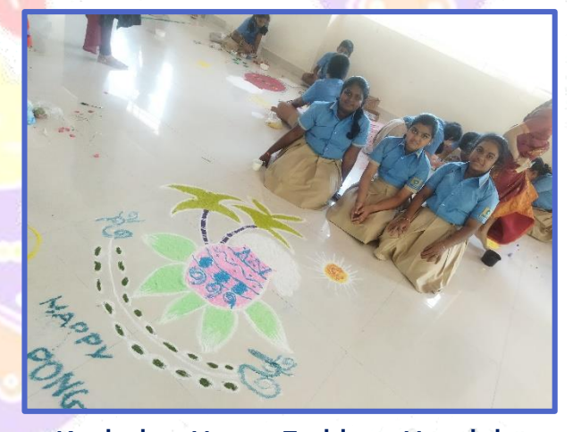
Kavipriya, Hasna Fathima, Haasini

On the morning of the competition, the courtyard was humming with anticipation as students started to show up with their materials. Each rice grain and colour powder was placed with great care as the pupils worked attentively and with intense concentration to construct their elaborate creations.