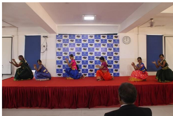
Sweetening the Graduation ceremony with a dazzling dance performance.