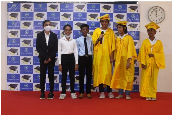
A rhythmical welcome note for the gathering of Graduation ceremony.