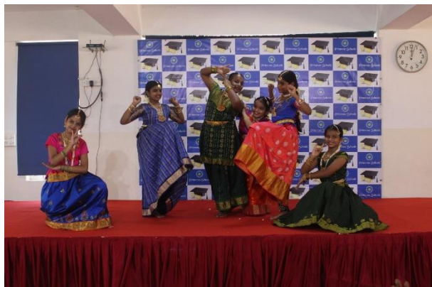
A spectacular dance performance by the girls of Class V