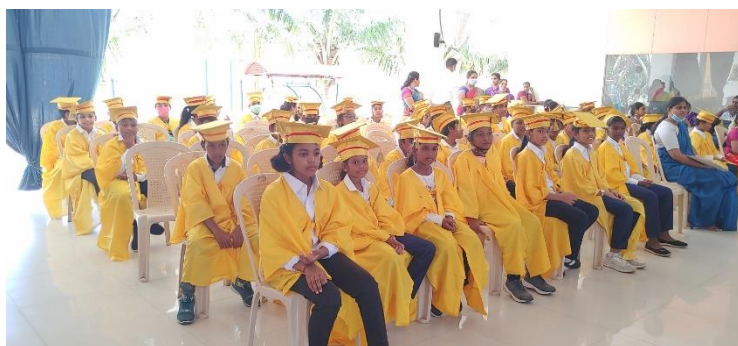
"Waiting Willingly", for the valuable moment