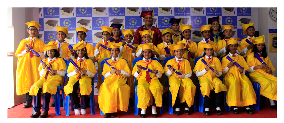
Class V B students Graduated to Class VI B (Primary to Middle School)