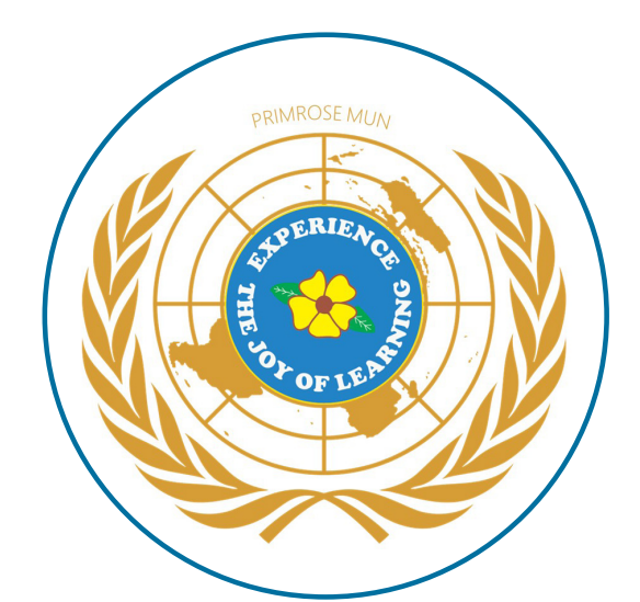
GARAV Co-Chair of UNSC