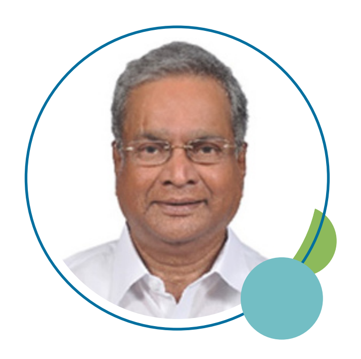
Message from the Chairman

"Perfect health, sincerity, honesty, straightforwardness, courage, disinterestedness, unselfishness, patience, endurance, perseverance, peace, calm, self-control are all the things that are taught infinitely better by example than by beautiful speeches."