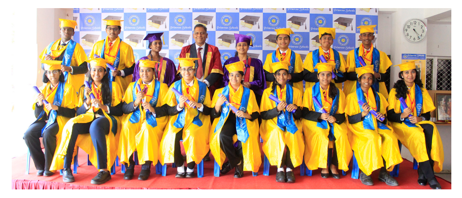
Class X students Graduated to Class XI (High to Higher Secondary School)

Graduation day is always a day of rejoicing as it symbolises the culmination of many years of hard work in the continuous pursuit of knowledge. To make it significant, at Primrose Schools we celebrated with fun, simple, but very memorable KG and primary school graduation.