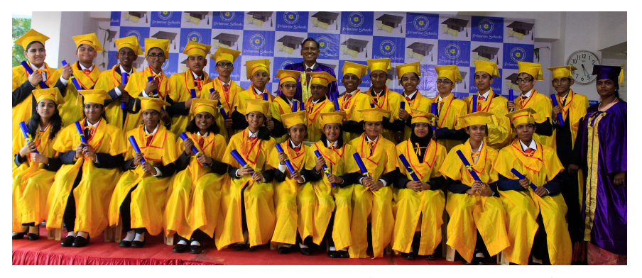
Class VIII students Graduated to Class IX (Middle to High School)