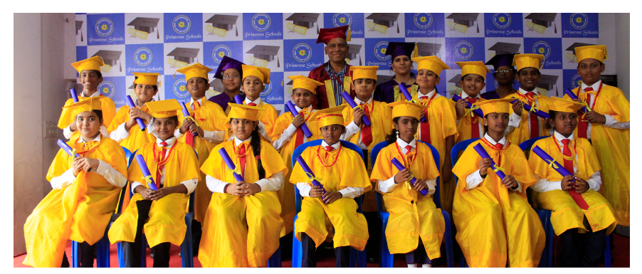
Class V A students Graduated to Class VI A (Primary to Middle School)